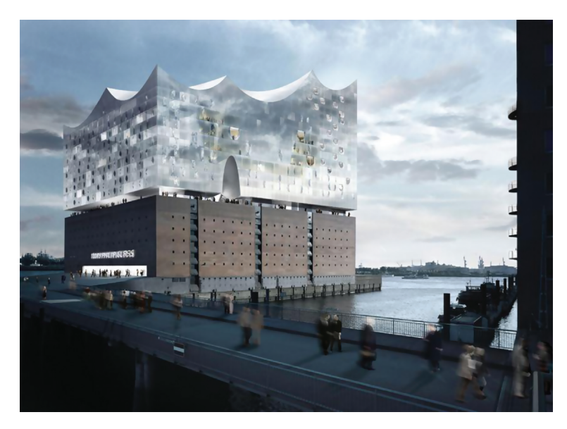
Figure 5. Herzog & de Meuron, Elbe Philharmonie. Copyright Herzog & de Meuron.

bind of both/neither—expose a tension that cannot be described in terms of the modern or the postmodern, but must be conceived of as metamodernism expressed by means of a neoromanticism.<sup>39</sup> If these artists look back at the Romantic it is neither because they simply want to laugh at it (parody) nor because they wish to cry for it (nostalgia). They look back instead in order to perceive anew a future that was lost from sight. Metamodern neoromanticism should not merely be understood as re-appropriation; it should be interpreted as re-signification: it is the re-signification of "the commonplace with significance, the ordinary with mystery, the familiar with the seemliness of the unfamiliar, and the finite with the semblance of the infinite". Indeed, it should be interpreted as Novalis, as the opening up of new lands in situ of the old one.