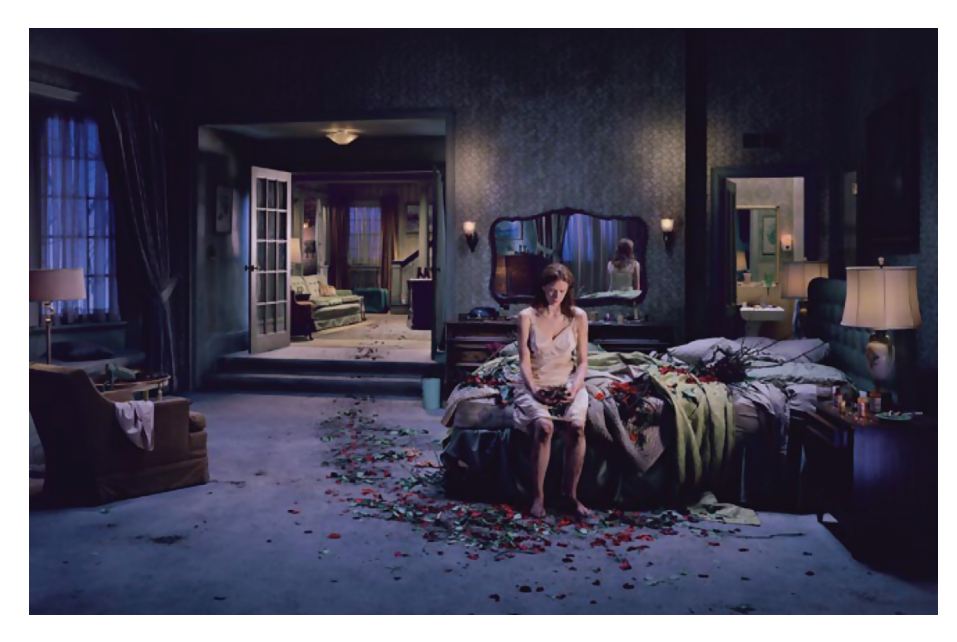
Figure 4. Gregory Crewdson, Untitled (2004). Photograph.

because architecture cannot but be concrete. The works of "starchitects" Herzog and De Meuron are exemplary here. Their more recent designs express a metamodern attitude in and through a style that can only be called neoromantic. A few brief descriptions suffice, here, to get a hint of their look and feel. The exterior of the De Young Museum (San Francisco, 2005) is clad in copper plates that will slowly turn green as a result of oxidization; the interior of the Walker Art Center (Minneapolis, 2005) holds such natural elements as chandeliers of rock and crystal; and the façade of the Caixa Forum (Madrid, 2008) appears to be partly rusting and partly overtaken by vegetation. While the above examples are appropriations or expansions of existing sites, their recent designs for whole new structures are even more telling. The library of the Brandenburg Technical University (Cottbus, 2004) is a gothic castle with a translucent façade overlain with white lettering; the Chinese national stadium (Beijing, 2008) looks like a "dark and enchanted forest" from up close and like a giant bird's nest from a far<sup>38</sup>; the residential skyscraper at 560 Leonard street (NYC, under construction) is reminiscent of an eroded rock; the Miami Art Museum (Florida, under construction) contains Babylonic hanging gardens; the Elbe Philharmonic Hall (Hamburg, under construction, see Figure 5) seems to be a