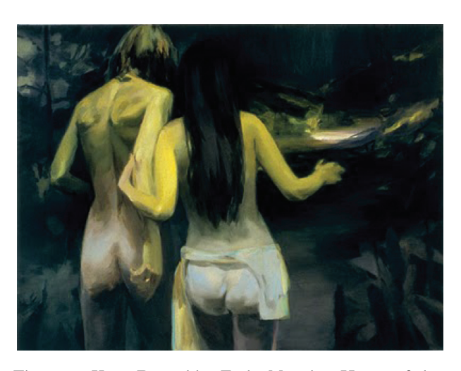
Figure 2. Kaye Donachie, Early Morning Hours of the Night (2003). Oil on Canvas.

One should be careful, however, not to confuse this oscillating tension (a both–neither) with some